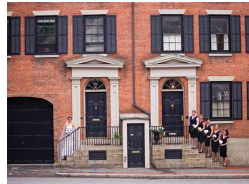
The beautiful architecture and natural history of the "creative capital" provided photographer Kate McElwee with an optimal backdrop.

When asked to describe their Providence destination wedding in one word she joyously says, "elegant."