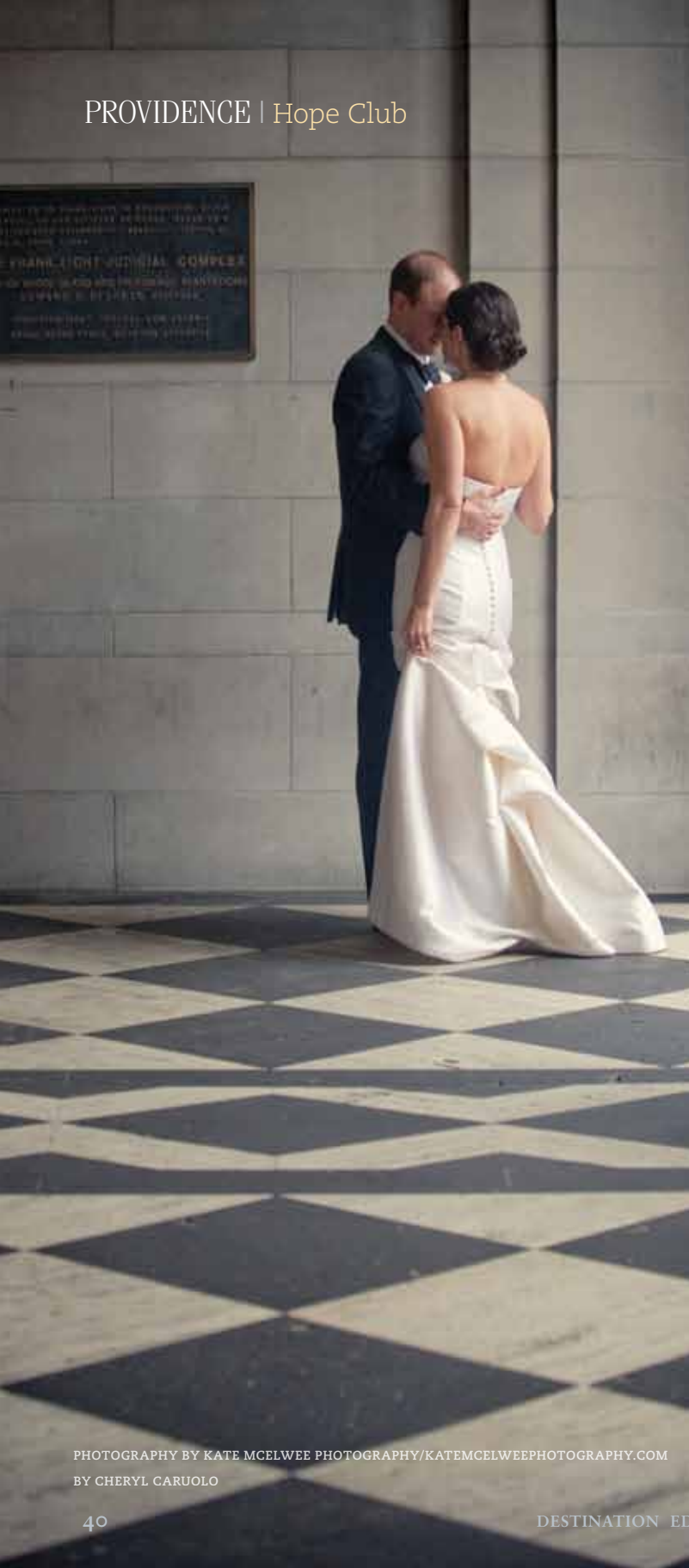
PHOTOGRAPHY BY KATE MCELWEE PHOTOGRAPHY/KATEMCELWEEPHOTOGRAPHY.COM BY CHERYL CARUOLO