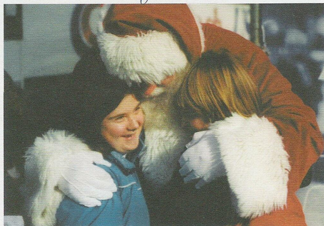
Santa greets the students and heads the State Police led caravan to Foxboro Stadium for a Holiday party with the Patriot's.